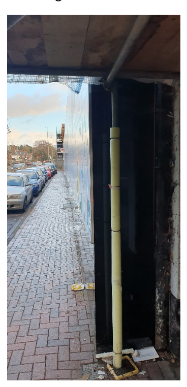
Hoarding side elevation looking southwest

Hoarding side elevation looking northeast